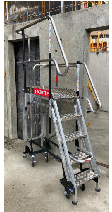
Photographs taken with test models