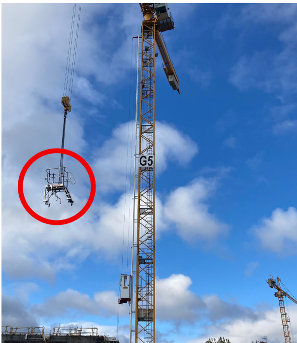
Photographs taken with test models